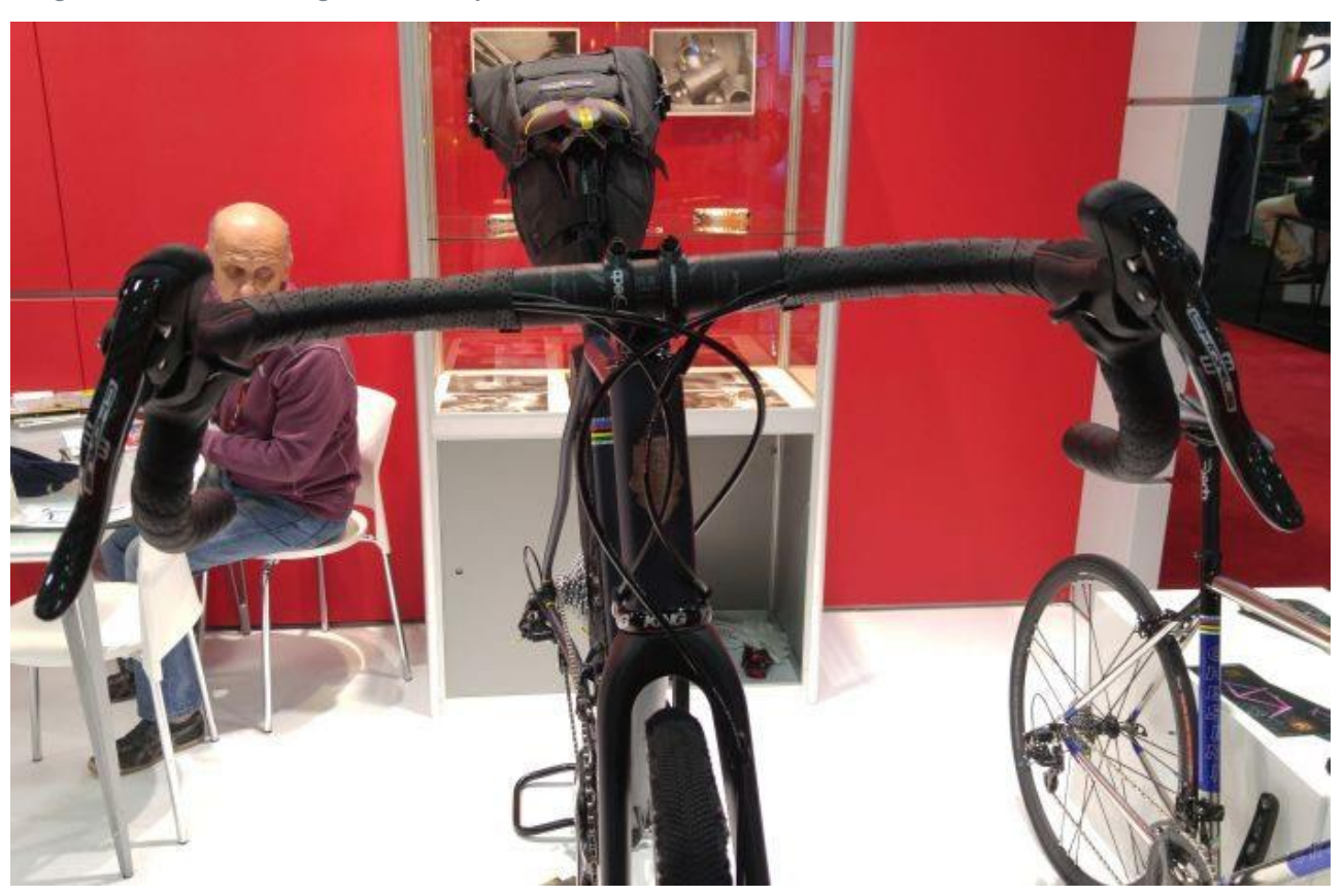
Chesini kept an Italian flavor with their cockpit choice, opting for Deda Superzero components.