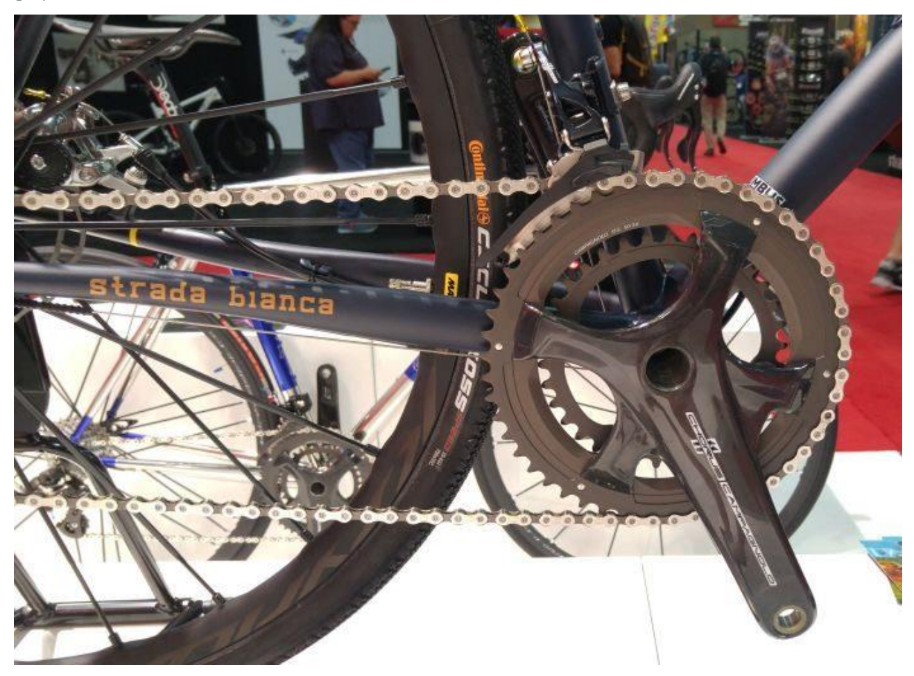
Chesini add a touch of class to the Strabia 2.0 display bike with Campagnolo's Chorus 11-speed mechanical groupset. Note the reference to Strada Bianca – a bicycle race in Tuscany, Italy, starting and finishing in the town of Siena. The Gravel Cyclist crew visited this area during the 2016 L'Eroica event.