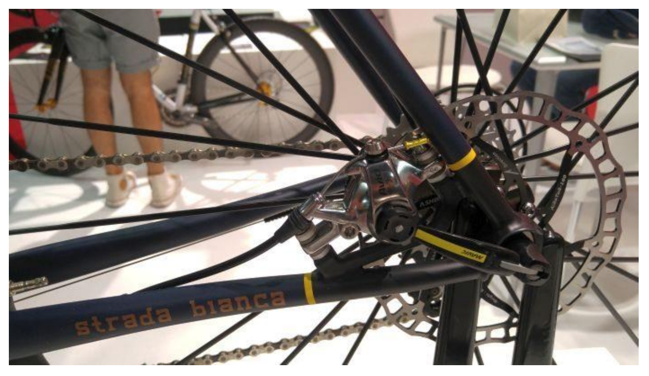
The post-mount brake standard is also used on the rear of the Strabia.