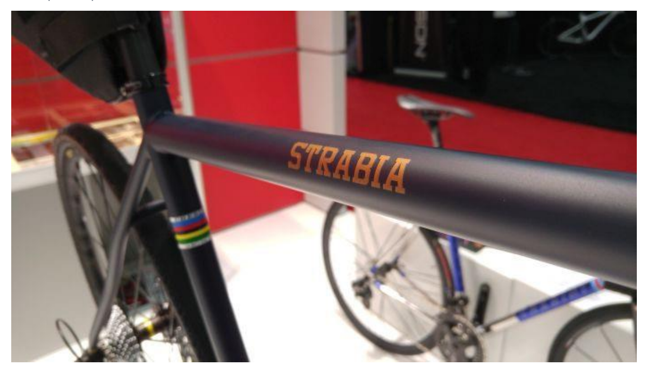
"Today, every Chesini bike is special because it is unique. Handbuilt one by one with dedication, skill, attention to detail and passion".