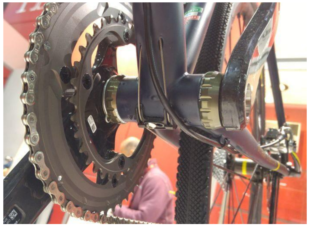
Neatly routed internal shifter and brake cables travel inside the downtube and exit just above the bottom bracket with externally bottom bracket cups.