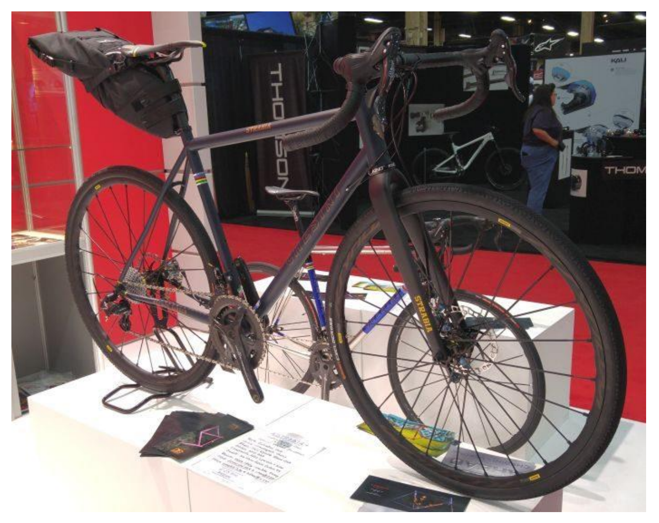
Success continued to follow the company – in 1963 a Chesini bike won the Solo 100 kilometre World Amateur Championship. In 1964 and 1965, riders aboard Chesini bikes won the Team 100 kilometre World Amateur Championships.