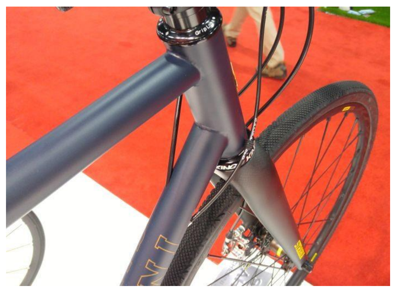
The bike's Columbus Mud full carbon T500S fork features a 3K weave finish, carbon dropouts, tapered 1 1/8" to 1.5" steerer tube and clearance for 700c x 42mm tyres. The Chesini Strabia 2.0 display bike features a Chris King headset – a rare sight these days but a nice touch.