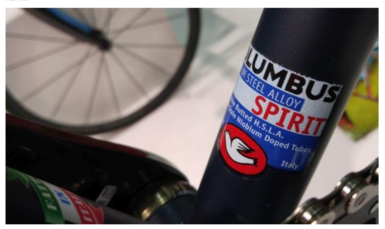
The Chesini Strabia 2.0 features a mix of Columbus Spirit and Zona tubing with tubes shaped specifically for Chesini.