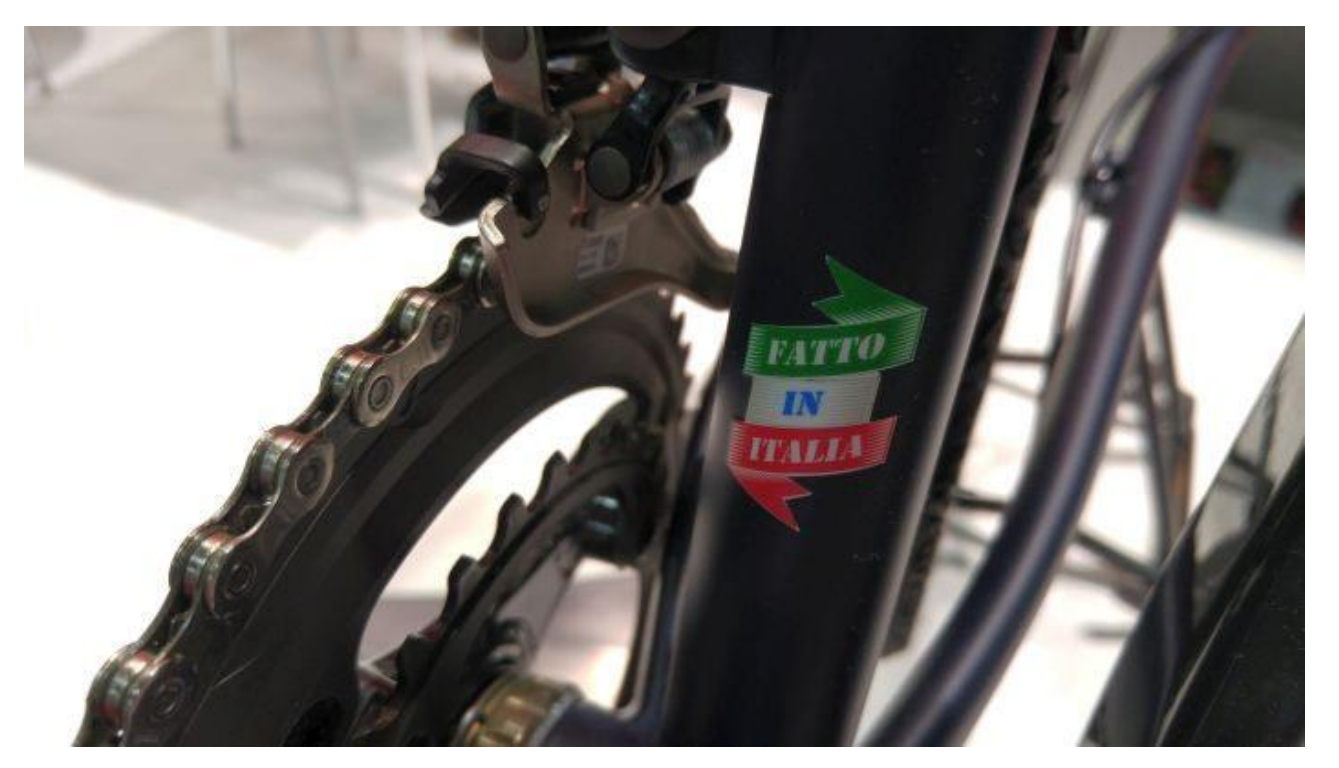
Fatto in Italia – Made in Italy. Unlike mainstream bicycles, Chesini offer full custom geometry, paint and graphics.