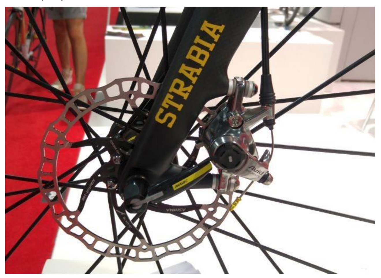
Avid BB7 mechanical disc brakes are an old standard but well-proven. This single piston design brake is simple to install and maintain. Brakes mount to the Columbus Mud fork using the post-mount standard.

The Chesini Strabia 2.0 model differs from the original 1.0 model in the dropouts. The newest version has what Chesini calls the classic "race shape" dropout. The bike utilizes regular 9mm quick releases, eschewing thruaxles completely.