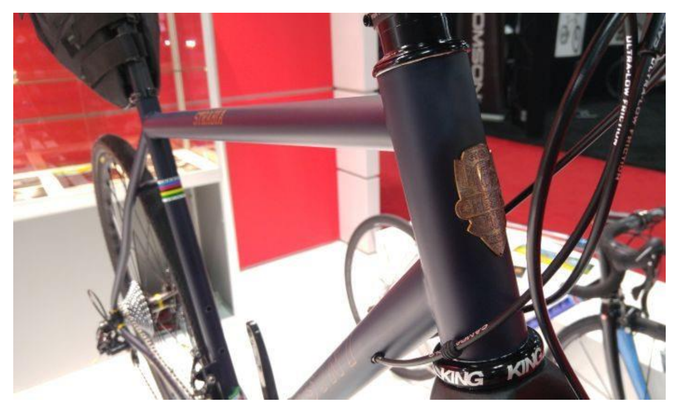
The Chesini Strabia 2.0 is the company's "no compromises" gravel bike, with a focus on speed, stability and precise steering – while providing a comfortable ride. Brake and derailleur cables are neatly routed inside the frame.