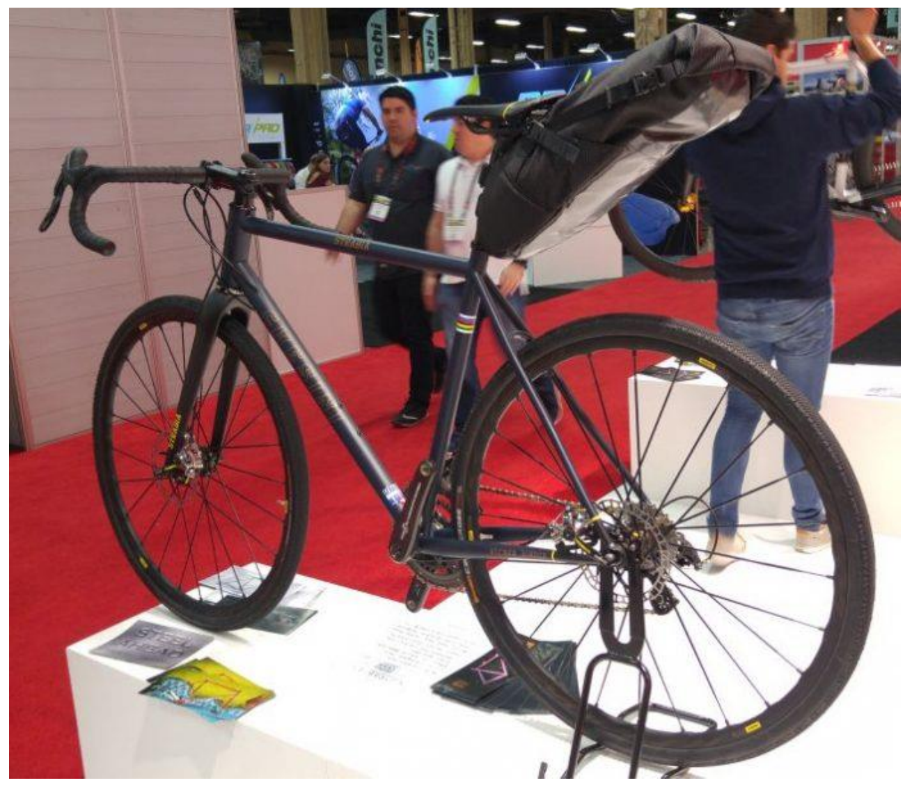
The Chesini Strabia 2.0 as pictured sans bag weighs 8.6 kilograms / 18.9lbs. Frame weight from 1840 grams. Priced at $US 2,220.00 / \in 1,980.00 for the frame, with the complete bike as pictured costing $US 4,370 / \in 3,870.00.